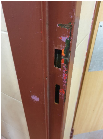
Figure 5. Peeling paint in the boys' bathroom – a photo taken by an activist and submitted as part of the retrial