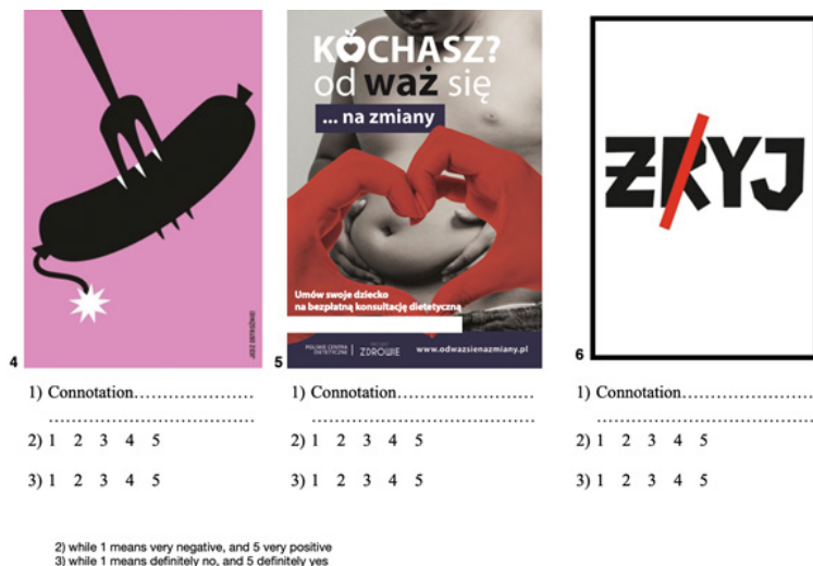
Figure 2. Focus group interview, connotation test form for the participants (p. 2)

Note: Translation of text from poster No. 5: "If you love, dare to change". Make an appointment for a free dietary consultation for your child. 1 Translation of text from poster No. 6: "Live / Devour". 2