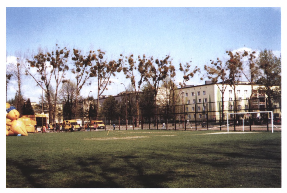
Fig. 4. Mistletoe ( Viscum album subsp. album ) in the crowns of poplar ( Populus x euamericana "Robusta"). Mielec, at the junction of Solskiego St. and Grunwaldzka St., near the stadium, stand no. 99. Photo by J. Bargiel, F. Święs, March 2003