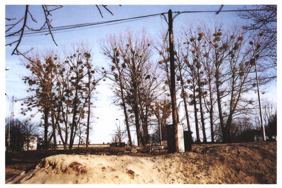
Fig. 5. Mistletoe ( Viscum album subsp. album ) in the crowns of poplar ( Populus x euamericana "Robusta"). Mielec, at Kwiatkowskiego Av., stand no. 110. March 2003