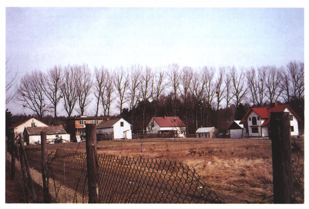
Fig. 2. Mistletoe ( Viscum album subsp. album ) in the crowns of poplar ( Populus x euamericana "Marilandica"). Mielec, at Królowej Jadwigi St., stand no. 49. March 2003