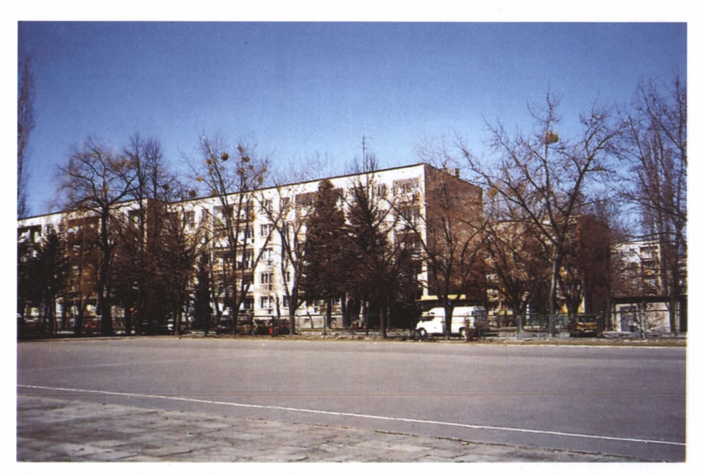
Fig. 3. Mistletoe ( Viscum album subsp. album ) in the crowns of maple ( Acer saccharinum ). Mielec, at the junction of Kopernika St. and Kusocińskiego St., stand no. 87. March 2003