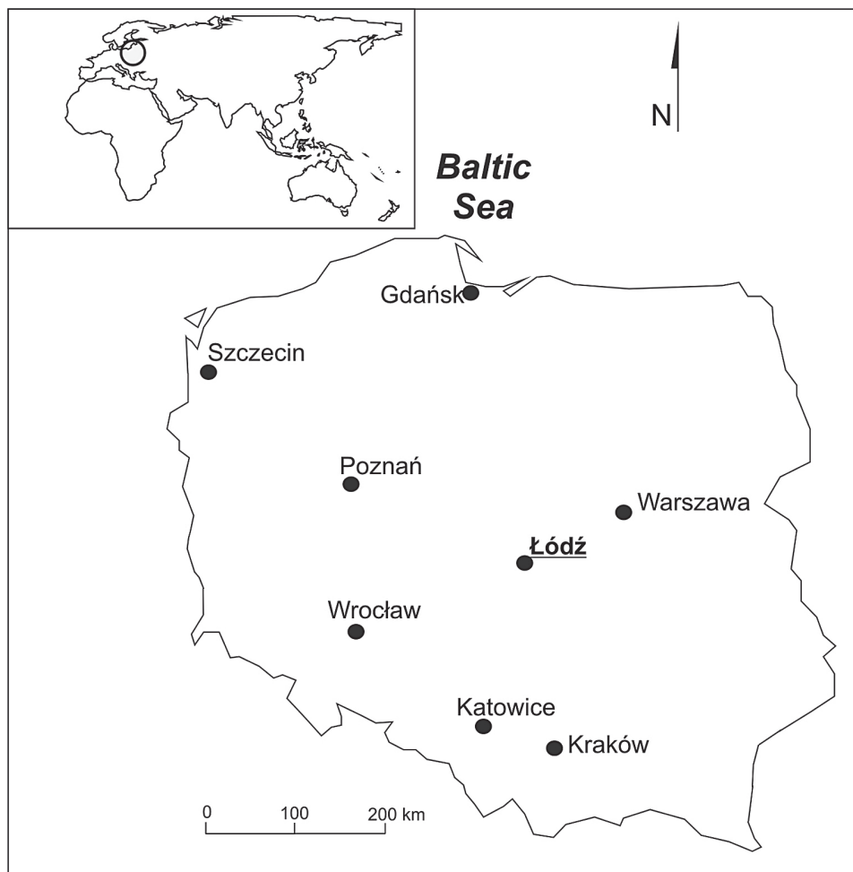
Fig. 2. Location of Łódź