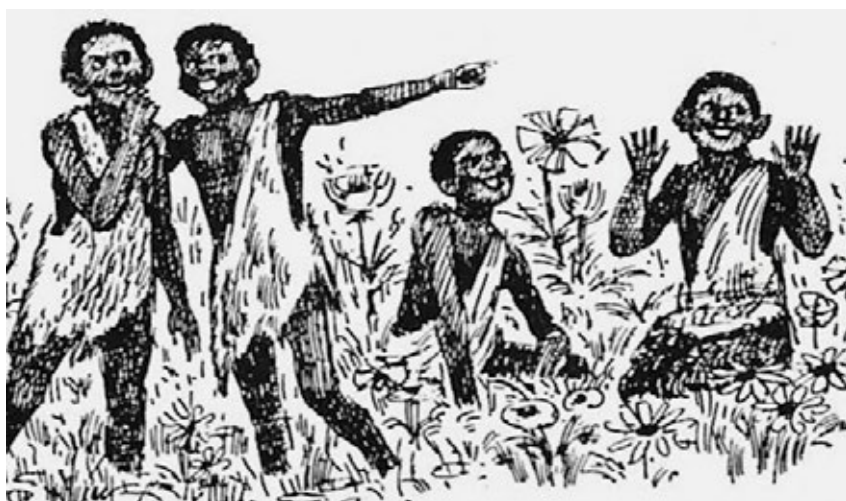
Picture 1. Black Oompa-Loompas illustrated by Faith Jaques in 1977 (copied from Treglown 1994).

The picture below presents illustrations in the first British edition in 1977, made by Faith Jaques.