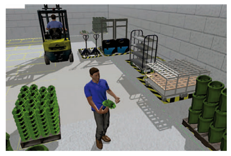
Figure 2. View of the analyzed site of the 3D digital twin

For the implementation of digital modelling, the authors used the model of the so-called digital twin in the fourth step of the method (K4), which in a fragment is shown in Figure 2.