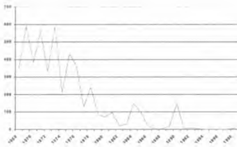
Fig. 1. Incidence rates in measles (per 100,000) in Poland in the years 1968-1998

In its natural course measles was characterized by a large number of cases and occurrence of epidemic increases every 2 years. It is confirmed by the analysis of the incidence of measles in Poland at the beginning of the analysed period that is in the years 1968-1973. The introduction of prophylactic vaccination against this disease disturbed this pattern. In Poland the prophylactic vaccinations against measles were initiated in 1972 and were permanently placed in the calendar of vaccinations in 1975 (7). The mandatory vaccination against measles is performed in children from 13 to 15 months of age (1).