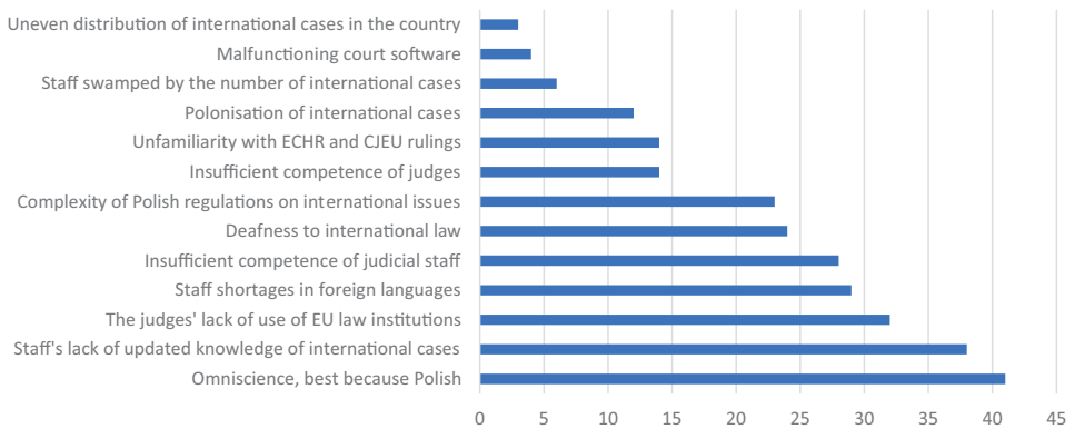
Figure 3. Main problems of Polish courts in international elements by lawyers surveyed (aggregated number of indications in interviews)

The lawyers who participated in the survey, drawing on their extensive experience within the judicial system, compiled a comprehensive catalogue identifying a range of issues perceived in Polish courts, particularly among court staff and judges, regarding the application of international and European Union law in routine judicial proceedings. The insights provided by these legal practitioners uncover a pervasive array of problems and deficiencies within the framework of the Polish judiciary.