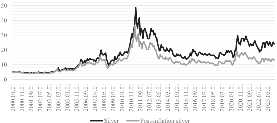
Figure 3. Spot silver price comparison due to CPI inflation in the United States