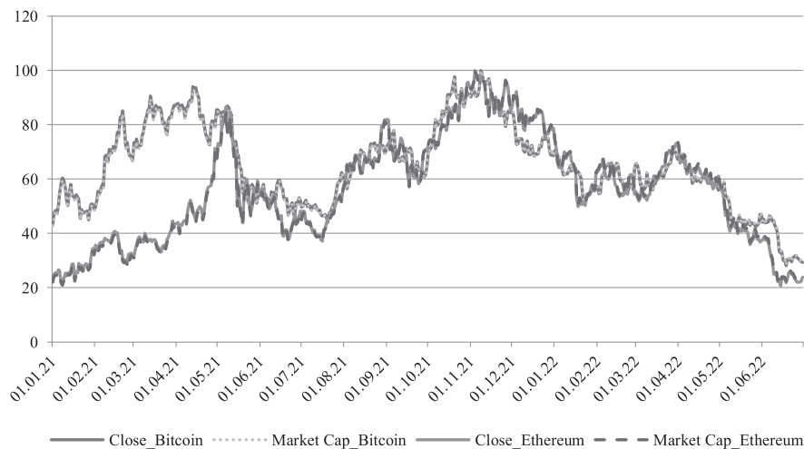
Figure 3. Standardized time series of Bitcoin and Ethereum quotations by Close and Market Cap categories in the period January 2021 – June 2022