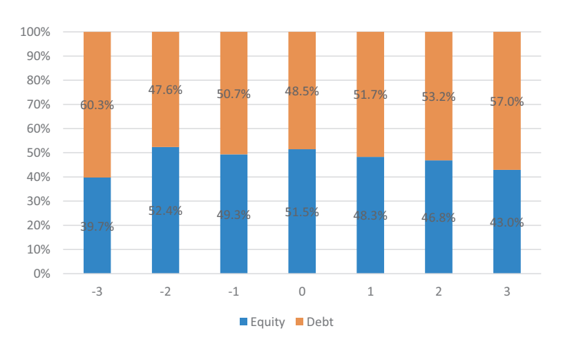
Figure 2. The structure of equity and debt in years -3 to +3