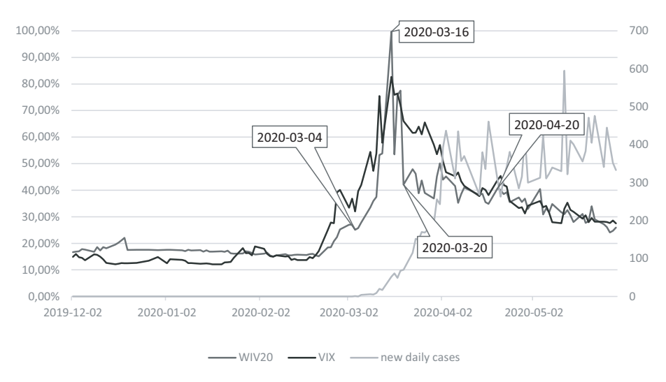
Figure 1. WIV20 and VIX indexes (a proxy of fear) and new daily cases of COVID-19 infection in Poland

Figure 1 presents the WIV20 and VIX indexes and new daily cases of COVID-19 infection in Poland during the period analyzed. This shows the relation between epidemic growth in Poland and increasing fear in the local and global context.