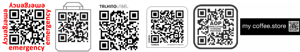
Figure 2. QR codes: a) emergency; b) Powa Technologies Limited; c) Talking Label; d) CHECK get organized for better food; e) AOP appellation d'origine protégée; f) my coffee.store

Source: EUTM 012609616, registration sought in classes 9, 16, 41; EUTM 014396766, registration sought in classes 9, 35, 36, 38, 42; EUTM 011298155, registration sought in classes 29, 30, 32, 33, 35, 41; EUTM 016530461, registration sought in classes 9, 35, 38, 42; EUTM 010266203, registration sought in classes 9, 32, 33, 34; EUTM 018061024, registration sought in classes 35 and 43.