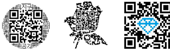
Figure 4. OR codes: a) ACBC S.r.l.; b) Noah s.r.l.; c) Trail Systems Oy

The mark exhibited in Figure 3a consists of a standard QR symbol compounded with verbal element. Distinctive character in that example is likely be attributable first to the distinctive character exhibited by the verbal element per se and, secondly, to the relative subservience of the standard QR symbol. On an interesting note, it is observed that, having been filed by the same applicant, the mark in Figure 3b stands to be a further customized version of that exhibited in Figure 2b. The different findings as regards the distinctive character thereof might likewise be ascribed to the additional (and distinctive) verbal element contained in the former. Moreover, chromatic elements (i.e., the blue shopping bag icon surrounding the code symbol and alignment patterns colorized alike) seem to provide further dissimilation from a standard code symbol. The remainder of specimens given in Figure 3 similarly incorporate verbal, chromatic as well as certain figurative elements, resulting in an overall distinctive character. 95