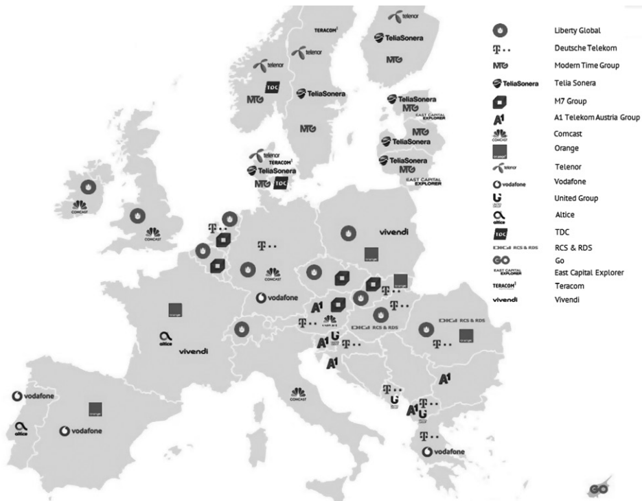
Figure 1. Pay AV services by ownership, geography segmentation (2017)

Figure 1 shows how closely the markets in each Member State are interconnected through the largest service providers. It is clear that most consumers in the Member States are fighting for the majority of consumers, that means that in most cases we can talk about limited competition.