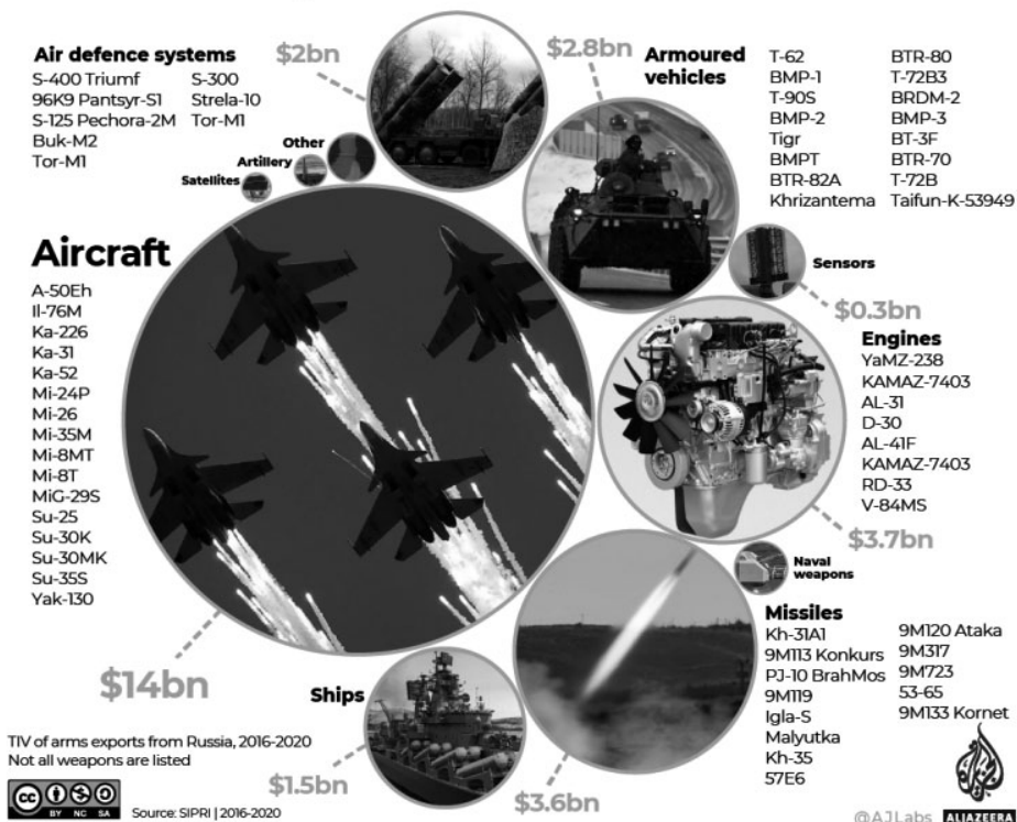
Fig. 2. Types of Weapons, which Russia exported to the International Market within 2016–2020

Half of Russia’s arms exports are aircraft. Many Russian weapons are upgrades to its Soviet-era arsenal but it is developing more advanced systems . Between 2016 and 2020, Moscow sold $28bn of weapons to 45 countries.