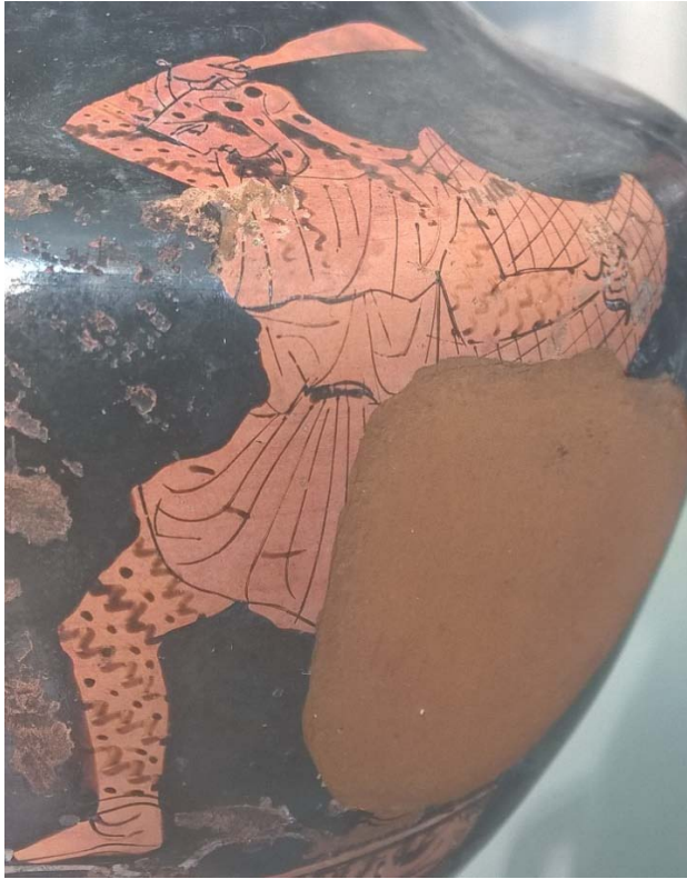
Fig. 1. Detail from a Greek red-figured vase (about 440 BC), slightly damaged, showing Amazon foot soldier in Iranian dress. In her left hand she wields a πέλιτη type shield, with a cutout at the top, while in her right a slashing sword, which can be identified with μάχαιρα of the shorter version. The British Museum, GR 1978.4–11.7 (E 220).