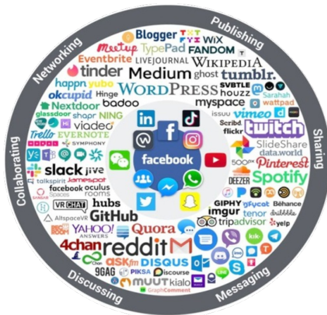
Figure 1. The social media landscape in 2020

Social media offers many opportunities to engage in dialogue with customers, as shown in Figure 1. Every year there are more and more such methods, however, it should be remembered that some of the presented ones are not yet available in different countries. Interestingly, Facebook and Twitter are the leaders in social media. A large number of Facebook users use it on average more than 30 minutes a day, and there are also other platforms such as Twitter, Instagram, Kik or Snapchat.