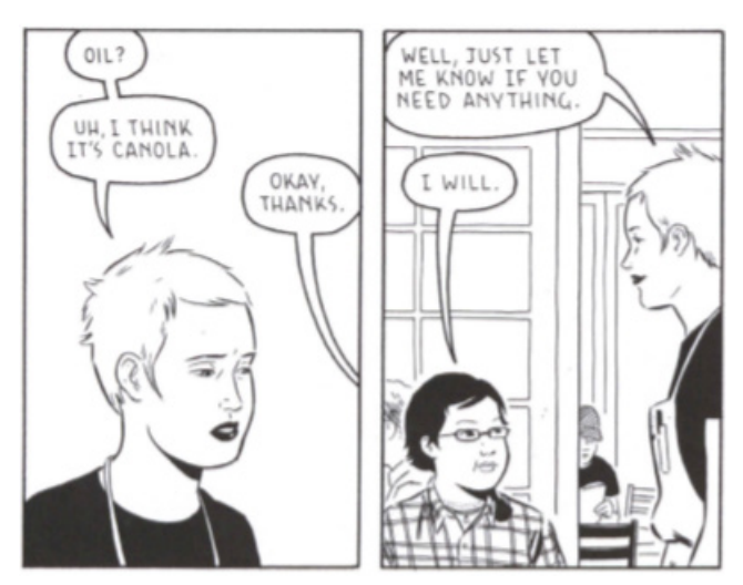
Fig 30. Tomine A. (2012). Shortcomings. London: Faber and Faber, p. 15.