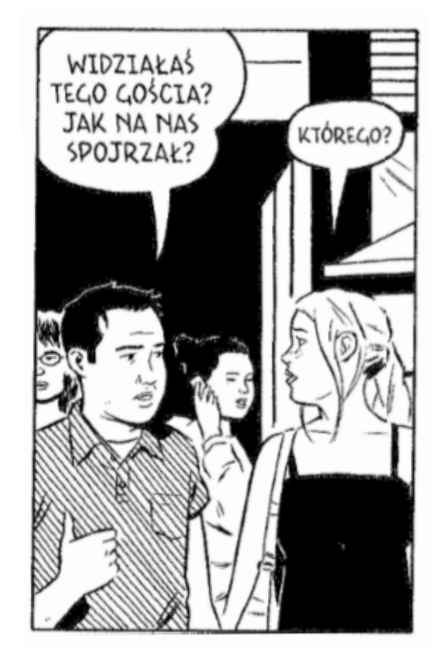
Fig 7. Tomine, A. (2010). Niedoskonałości. Trans: Murawska, A. Warszawa: Kultura Gniewu, p. 68.