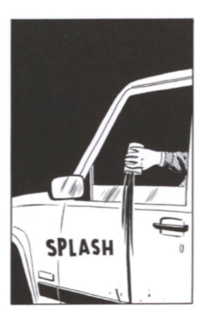
Fig 10. Tomine, A. (2012). Shortcomings . London: Faber and Faber, p. 37.