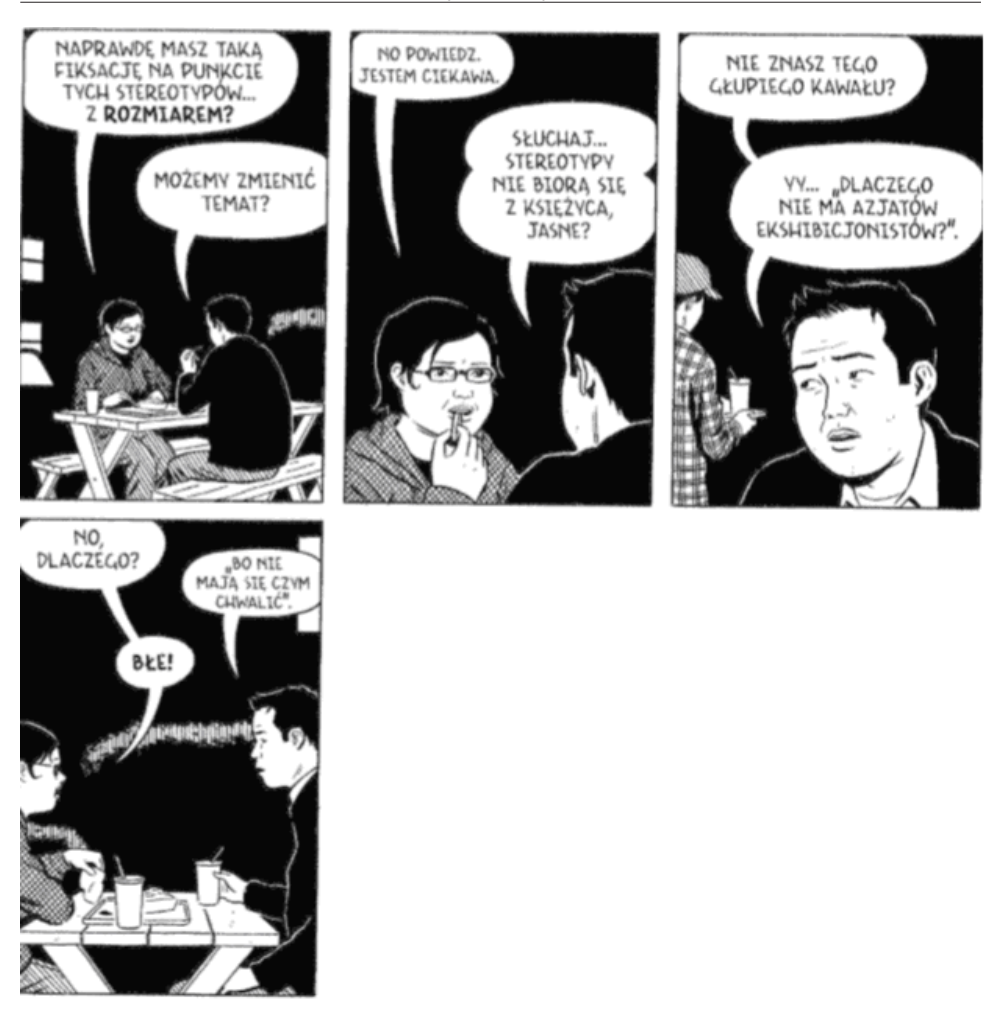
Fig 27. Tomine, A. (2010). Niedoskonalości . Trans: Murawska, A. Warszawa: Kultura Gniewu, p. 57.

The joke in the English version is based on the difference between the words 'Caucasian' and 'Asian,' which, apart from the meaning, is the syllable 'cauc' at the beginning of the former. The pun bases on the alleged correspondence between the length of these words and the size of Caucasians' and Asians' penises as well as the homophonic resemblance between 'cauc' and 'cock.' It is impossible to convey it literally into Polish, as 'Caucasian' translates into 'biały" (white) and 'Asians' into 'Azjaci.' There is no similarity between the two. Murawska's solution is well-conceived, as it conveys the same preconceptions and also regards the size of phalluses in a racist, though humorous, way, even though it is realized in a completely different way. The reaction of the Polish readers is likely to be the same as that of the readers of the original.