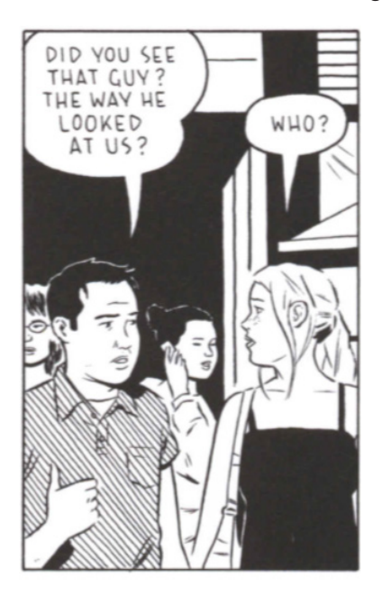
Fig 6. Tomine, A. (2012). Shortcomings . London: Faber and Faber, p. 68.

Spatial constraints are a good example of such limiting factors. Sometimes it may be challenging to fit the translated text in a speech bubble. Changing their shapes and sizes is not a common practice; not only is it costly, but it can also ruin the original composition of a panel or even an entire page. The solution provided in Shortcomings is, wherever necessary, making the font smaller, like, for example, in the second bubble in the Polish version of the following panel: