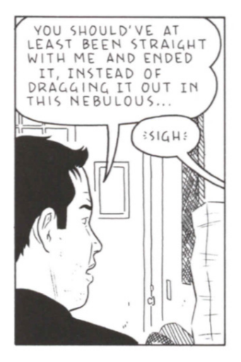
Fig 3. Tomine, A. (2012). Shortcomings. London: Faber and Faber, p. 100.

Motion lines are scarce and subtle and appear usually when Ben slams the phone or throws something on the ground: