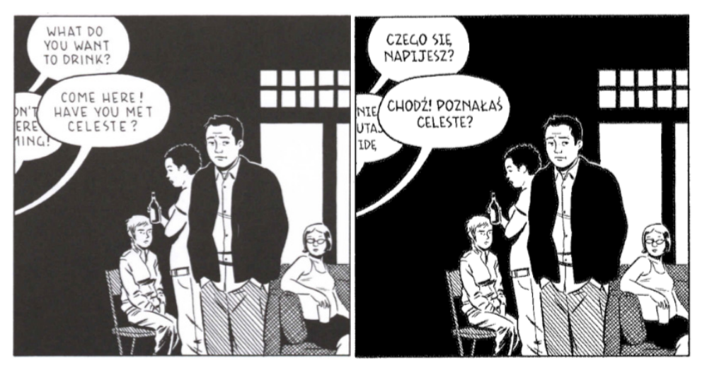
Fig 12. Tomine, A. (2012). Shortcomings . London: Faber and Faber, p. 52.

The final convention I want to point out is Tomine's way of showing how speech bubbles sometimes overlap and bleed into the text from other bubbles when protagonists interrupt each other: