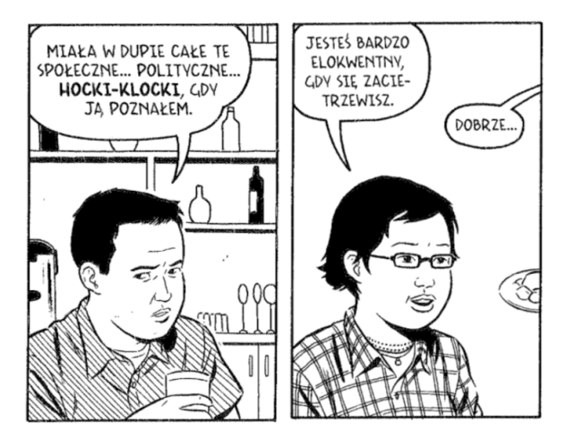
Fig 25. Tomine, A. (2010). Niedoskonałości . Trans: Murawska, A. Warszawa: Kultura Gniewu, p. 79.

'Whatever' translates into Polish as "cokolwiek." It cannot be used in this context in Polish as the phrase "polityczne cokolwiek" ( political whatever ) is not something a Pole would say. The use of the word 'whatever,' when a speaker is not able or cannot be bothered to find an appropriate, meaningful way to express themselves, functions in English, but in Polish it would not seem natural. Murawska chose the expression 'hocki klocki'; the word 'hocki' is an old Polish onomatopoeic expression which signifies 'jumping'; 'klocki' means 'blocks,' as in 'the LEGO blocks.' Together, these two words rhyme, and stand for meaningless, silly matters, unworthy of any attention. It is not a literary expression; in fact, it sounds a bit awkward and obsolete. For these reasons, it fits perfectly in Ben's complaining about Miko's interest in politics: