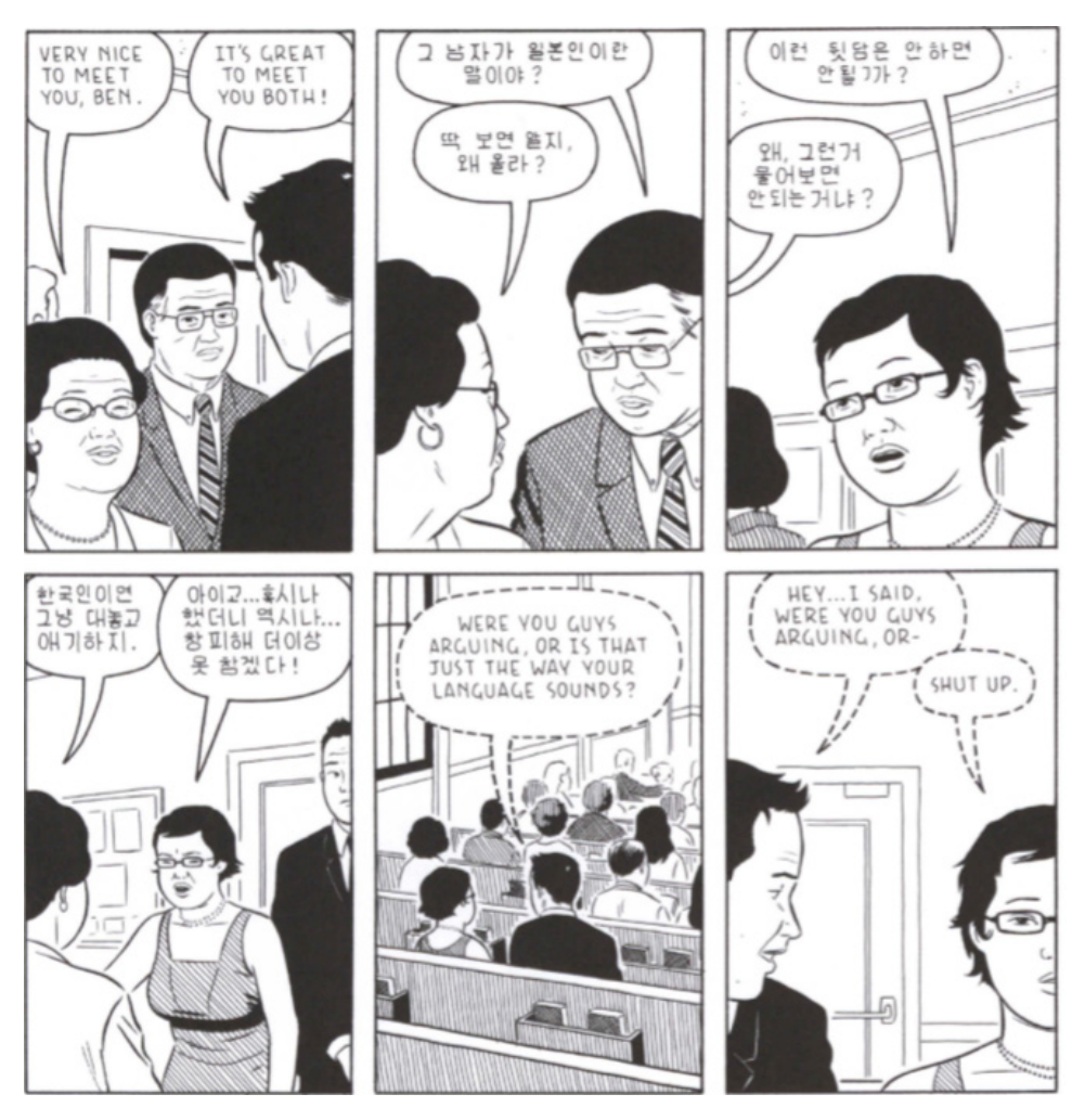
Fig 28. Tomine A. (2012). Shortcomings. London: Faber and Faber, p. 27.

The appearance of passages in Asian languages with no translation in the original is also important in terms of creating tension and depicting characters' emotions, as seen in the following excerpt: