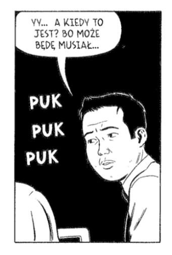
Fig 9. Tomine, A. (2010). Niedoskonalości . Trans: Murawska, A. Warszawa: Kultura Gniewu, p. 68.