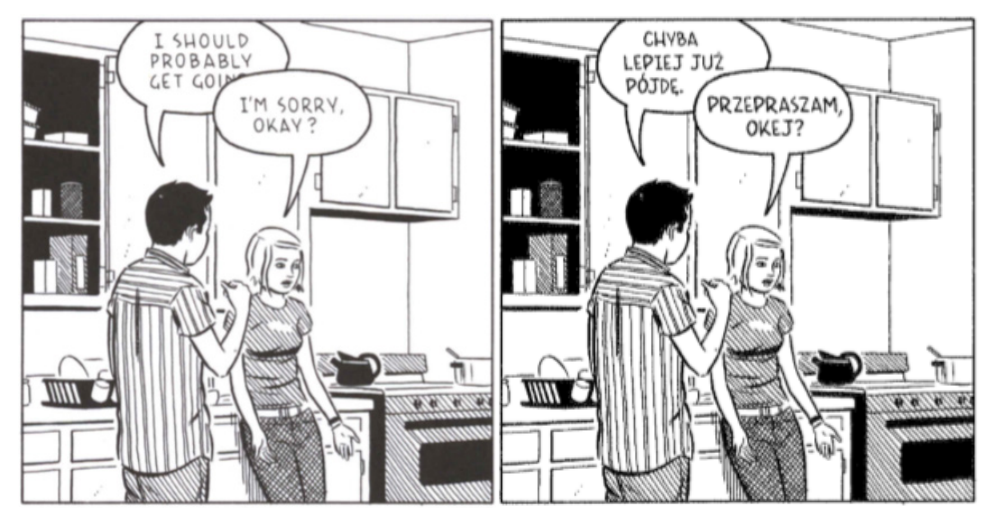
Fig 14. Tomine, A. (2012). Shortcomings . London: Faber and Faber, p. 50.

This convention was maintained in all cases but one: