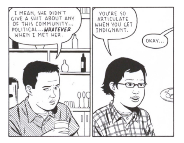
Fig 24. Tomine, A. (2012). Shortcomings. London: Faber and Faber, p. 14.

'Whatever' translates into Polish as "cokolwiek." It cannot be used in this context in Polish as the phrase "polityczne cokolwiek" ( political whatever ) is not something a Pole would say. The use of the word 'whatever,' when a speaker is not able or cannot be bothered to find an appropriate, meaningful way to express themselves, functions in English, but in Polish it would not seem natural. Murawska chose the expression 'hocki klocki'; the word 'hocki' is an old Polish onomatopoeic expression which signifies 'jumping'; 'klocki' means 'blocks,' as in 'the LEGO blocks.' Together, these two words rhyme, and stand for meaningless, silly matters, unworthy of any attention. It is not a literary expression; in fact, it sounds a bit awkward and obsolete. For these reasons, it fits perfectly in Ben's complaining about Miko's interest in politics: