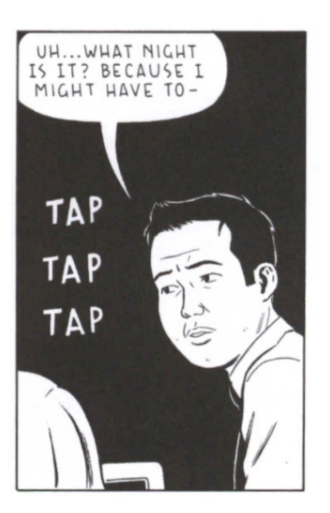
Fig 8. Tomine, A. (2012). Shortcomings . London: Faber and Faber, p. 58.

Another element of pictorial conventions exercised in Shortcomings is sound effects. Onomatopoeic expressions were 'translated,' i.e., replaced by echoic words which comply with Polish conventions, as exemplified by the following excerpts: