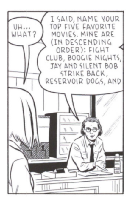
Fig 16. Tomine A. (2012). Shortcomings . London: Faber and Faber, p. 20.

Apart from the Zanettin's 'articulatory grammar' and the constraints it imposes, the language and cultural references pose challenges in Shortcomings . Allusions to other works appear; some of them are quite straightforward, as in the following frame: