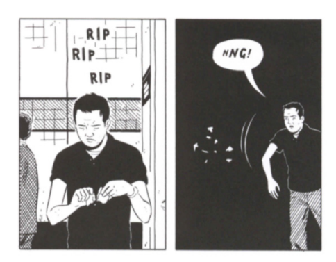
Fig 4. Tomine, A. (2012) Shortcomings. London: Faber and Faber, p. 104.

Motion lines are scarce and subtle and appear usually when Ben slams the phone or throws something on the ground: