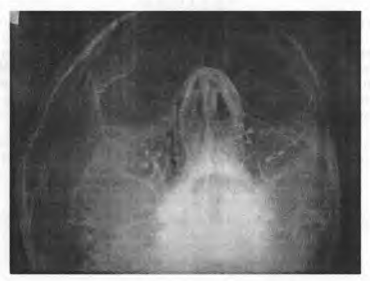
Fig. 7. Status post total cystectomy performed within the mandible and the maxilla