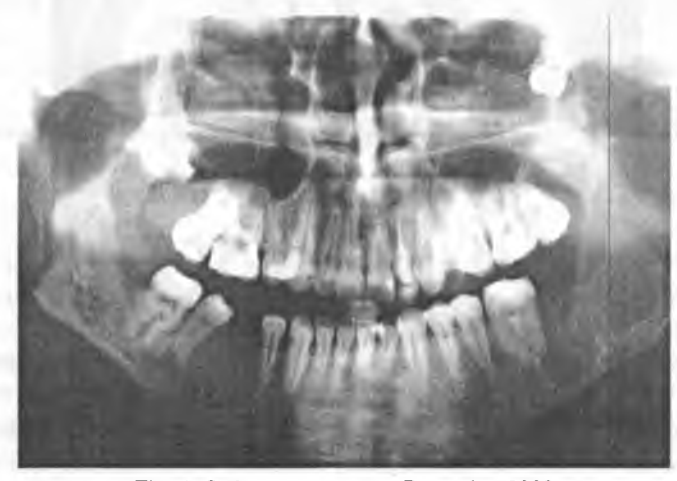
Fig. 4. Orthopantomogram, December 2000

Based on clinical and radiological examination the surgical treatment was divided into: 1) total cystectomy of bilateral mandible lesion, in the mandible and marsupialization of the lesion in the maxilla, 2) cystectomy in the maxilla in the second stage. In September 2000 the patient underwent surgical procedure in total anaesthesia. From intraoral approach a part of the mandible in which cysts were located, was exposed. Lesion from the corpus and ramus of the mandible have been removed totally. Also marsupialization of maxillary cysts has been obtained during surgery. The removed material was sent for histopathological examination which confirmed the previous diagnosis as Cystis dentigerous . After surgical treatment the patient has been treated a follow-up examination in outpatients' clinic. In December 2000 and March 2001 the patient underwent CT examination. In both follow-up CT scans showed remodelling and strengthening of the maxilla bone structure. Also another CT examination made in August 2001 confirmed the process of bone remodelling.