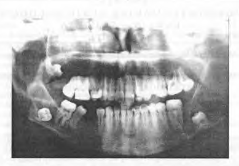
Fig. 1. Orthopantomogram, September 2000

In order to evaluate the size of the lesion, especially in the maxilla the patient had computer tomography of the region. CT scan showed cyst like lesion with teeth buds bilaterally causes maxilla bone remodelling and in large area expression of the cyst in maxillary sinuses.