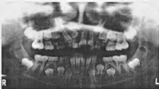
Fig . 4. Pantomogram with a visible odontoma at the retained tooth 11 in a 9-year-old girl

and "picked out" about 5 little formations, resembling little teeth. Despite this event the operation was not cancelled. In local anesthesia with 2% lignocain with noradenalin, after surgical denudation of the dental process bone in the region of tooth 15 the defragmented capsule of tumor was removed in total, together with a small, tooth-like formation. During the procedure the crown of retained tooth 15, situated very high, was denuded. Intraoperational evaluation and analysis of the roentgenogram suggested unfavourable position of the retained tooth 15, right under tooth 14. Therefore, it was very likely that tooth 14, tooth 13, nasal cavity and maxillary sinus would be injured during operation. Due to imminent complications, having consulted an orthodontist, a decision was made to save the retained tooth for observation and, in case of an ache, to extract tooth 14 and introduce the retained tooth 15 into the dental arch by means of orthodontic methods.