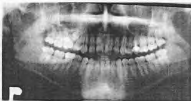
Fig. 7. Pantomogram of an odontoma at the retained tooth 15 in a 25-year-old patient