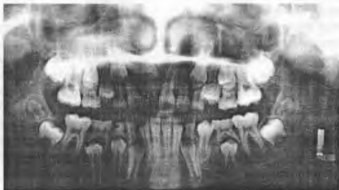
Fig. 5. Pantomogram 10 months after the first surgical procedure