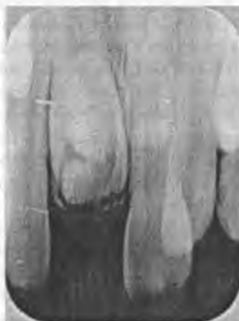
Fig. 2. Radiovisiography of an odontoma in the region of retained tooth 11 in an 8-year-old girl