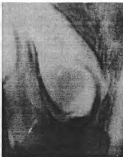
Fig. 6. Radiovisiography with a visible odontoma at the retained tooth 11 ten months after the first surgical procedure