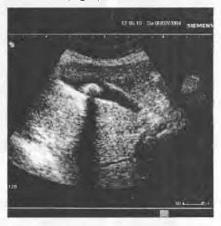
Fig. 4. The concrement in the gall bladder in THI mode

In eight patients the acoustic shadow was more evident, wider and with sharper margins in the harmonic mode than on standard images. In five cases on standard mode the presence of inspissated bile was found in gall bladder apart from the deposits, but examination in the harmonic mode excluded the presence of bile sludge in four cases (Fig. 4).