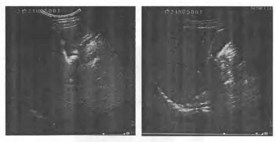
Fig. 1. Concrement in the gall bladder cervix. A – standard mode, only the reflection of the echo is seen; B – harmonic mode reveal both reflection of the echo and the acoustic shadow