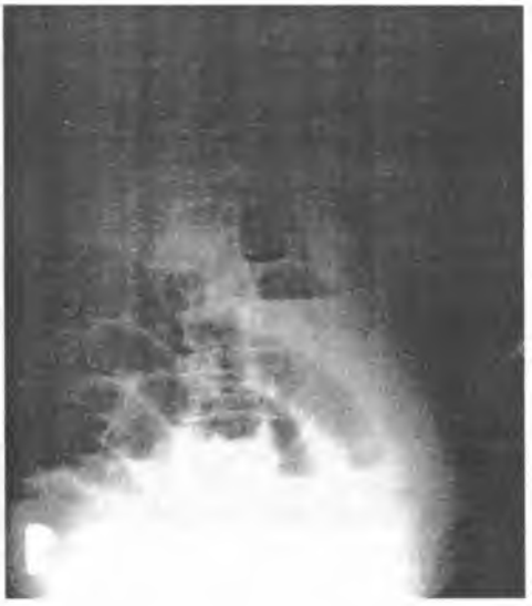
Fig. 2. Multiple air/fluid levels with terrace-like appearance in lower small bowel obstruction