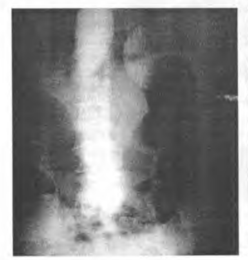
Fig. 3. Air/fluid levels in large bowel obstruction on plain radiographs