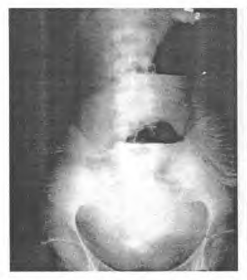
Fig. 1. The air/fluid levels in high small bowel obstruction on plain radiographs