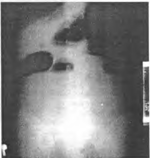
Fig. 4. Air/fluid levels in large bowel obstruction on plain radiographs. Lower part of the abdomen showing higher density due to ascites