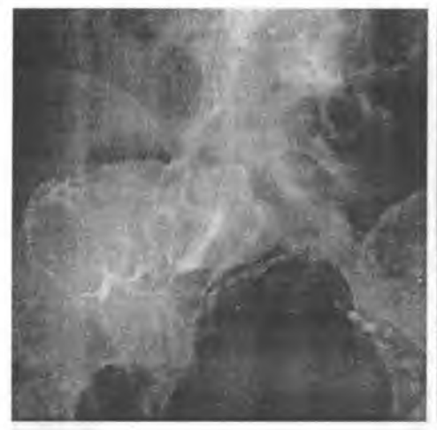
Fig. 5. Intussusception of sigmoid colon on double contrast examination