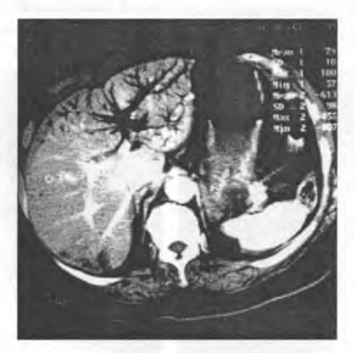
Fig. 7. Gas in the biliary tree in the patient with gall stone bowel obstruction