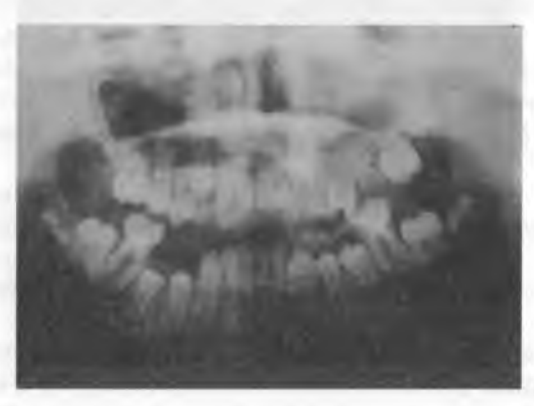
Fig. 1. Panoramic radiogram before the extraction of the root of 16th tooth – visible remodelling of the osseous structure of the maxillary alveolar process with the periosteal reaction

reaction was stated. The picture might have corresponded with the diagnosis of actinomycosis (Fig. 1, Fig. 2).