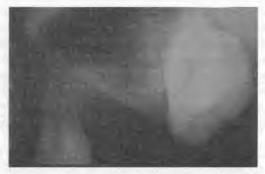
Fig. 2. X-ray of the alveolus of the 16th tooth – condition after the extraction of roots of the 16th tooth

It is worth mentioning that in blood cell count performed on the day of patient's admission the leukocyte level was increased up to 18,000. The extraction of the 16th tooth was performed in infiltration anaesthesia with 2% Lignocaine and Noradrenaline. Considerable amount of granulation curetted from the alveolus was sent for histopathological examination. The alveolus was surgically supplied. The patient was ordered 600 mg Lincocin twice a day, Rutinoscorbin and calcium. The process of post-operative healing did not reveal any complications. The sutures were taken off seven days after the procedure.