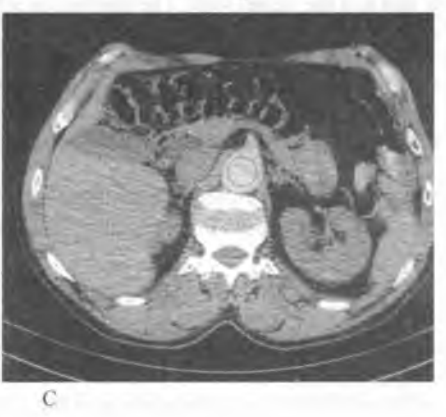
Fig. 1. The region of interest (ROI) marker positioned in the aortic lumen. A – the first section after starting contrast injection, the enhancement of the aortic lumen equals 1 HU. B – after 22 sec the aortic enhancement equals 27 HU; C – after 24.5 sec, the aortic enhancement equals 69 HU