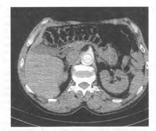
Fig. 2. Scan obtained 26 sec after the beginning of the contrast agent injection – the aortic enhancement exceeded the threshold level of 100 HU