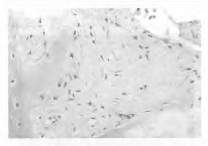
Fig. 7. Histopathological tests (H+E. Magn. 250x)