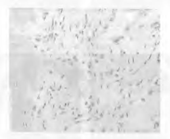
Fig. 4. B.B. – Irregularly shaped trabecula of bone lie in a moderately cellular fibrous stroma. (H+E. Magn. 250x)