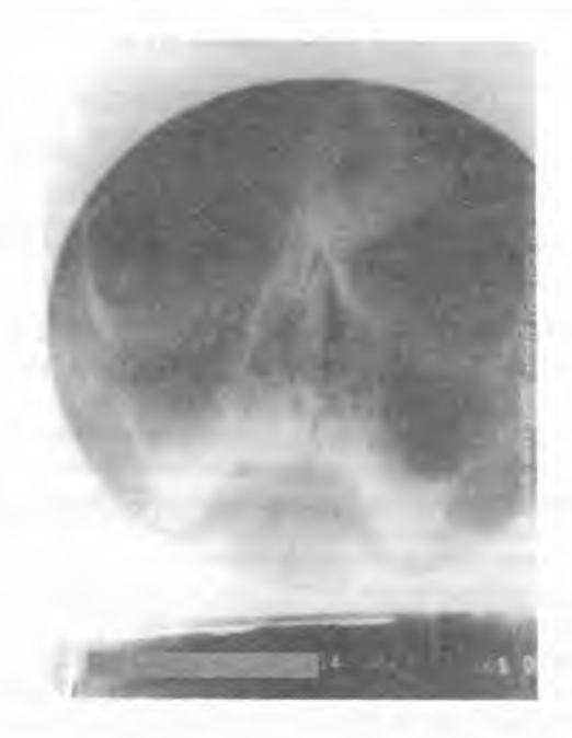
Fig. 1. B.B. – X-ray imaging of paranasal sinuses