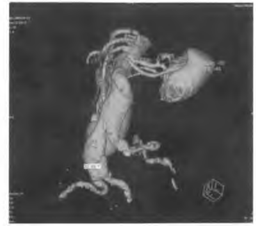
Fig. 3. VRT image of abdominal aortic aneurysm with involvement of right iliac artery.