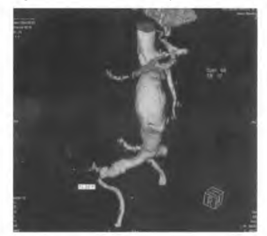
Fig. 2. VRT image of abdominal aortic aneurysm with involvement of right iliac artery, with angle between common and external iliac artery of 71.32°