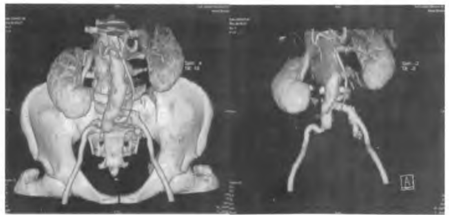
Fig. 2. A – abdominal aortic aneurysm on VRT image; B – VRT image after editing of the bone structures clearly reveal involvement of the right iliac artery

Fig. 1. A – abdominal aortic aneurysm. Axial section with annular thrombus; B – MPR reconstruction with angulations of the aorta; C – VRT image clearly revealing the morphology of the aneurysm; D – VRT image after editing of the bone structures