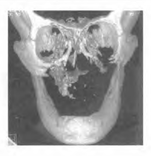
Fig. 2. Pseudo-3D CT reconstruction in the same patient well presents spatial