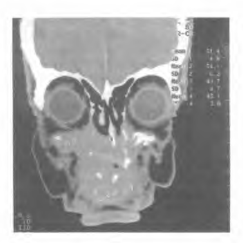
Fig. 1. Coronal CT scan in a patient with neoplasm of the left maxillary sinus infiltrating the nasal cavity and right maxillary sinus