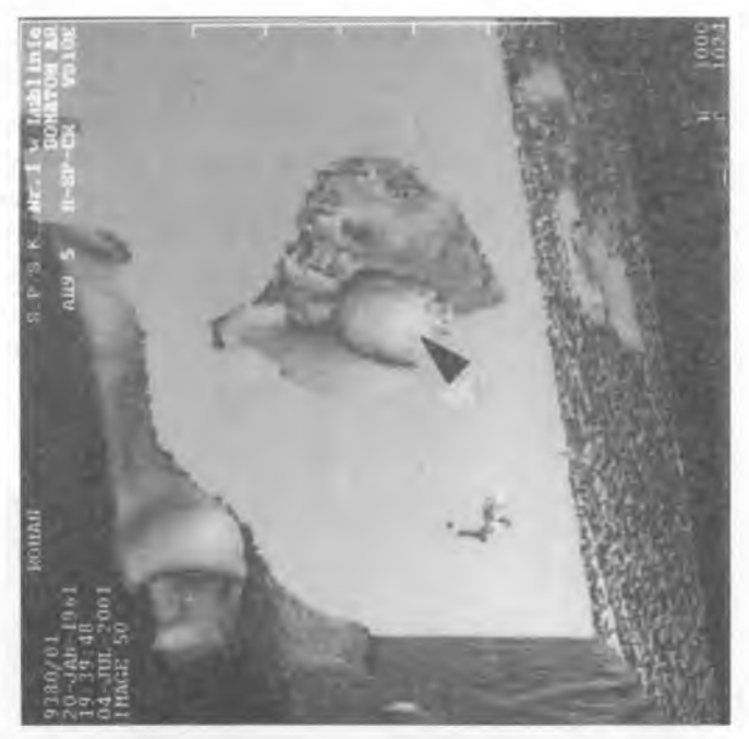
Fig. 2. VS - polyp in the left maxillary sinus (arrow)