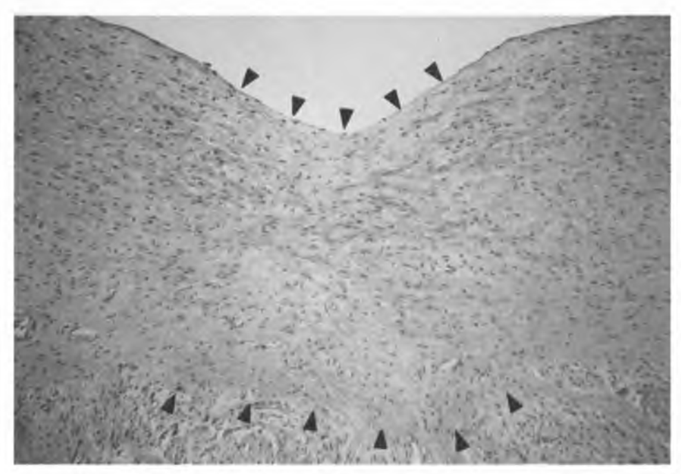
Fig. 1. Left ventricular fibroelastosis (arrowheads) in hypoplastic left heart syndrome (H+E, 100x)

The mean heart weight was 29.5 g \pm /- 8.9 with a range between 12.0 and 48.0 g. In all cases gross examination revealed rudimentary left ventricle, as well as hypertrophied and dilated right ventricle and atrium. The left heart valvular abnormalities were as fol-