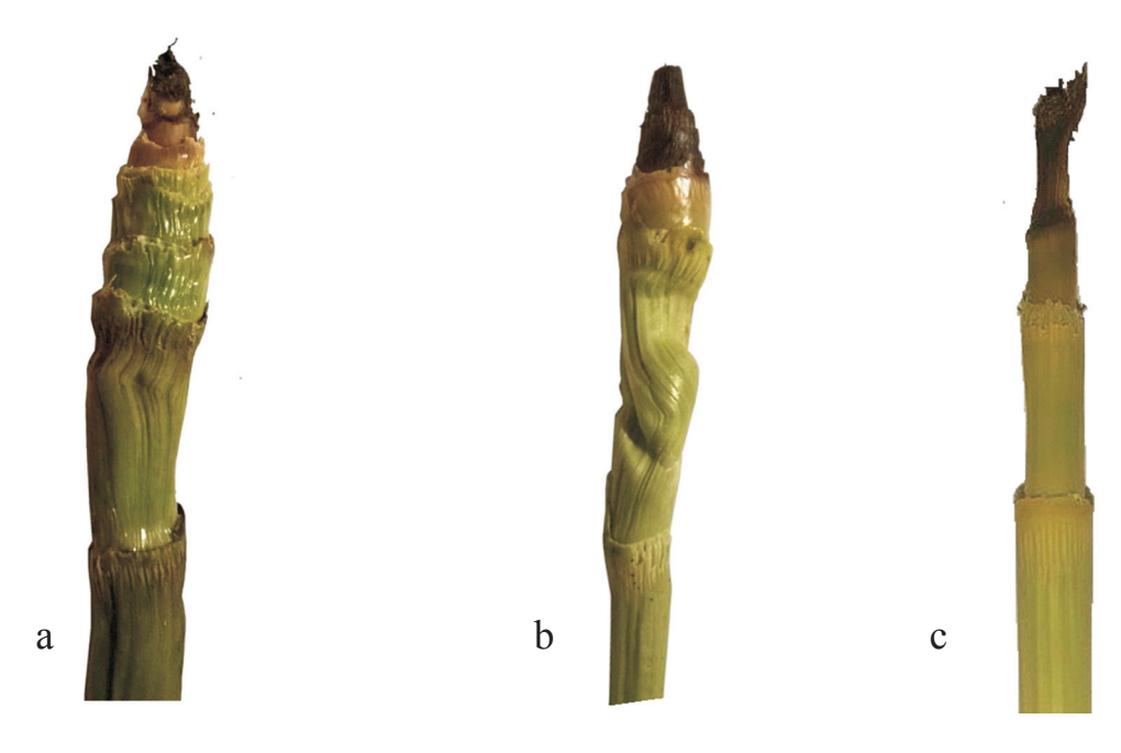
Phot. 2. Basal part of galls with leaves removed: apically widened gall of L. pullitarsis - a, rod-shaped gall of L. pullitarsis - b; gall of L. similis - c