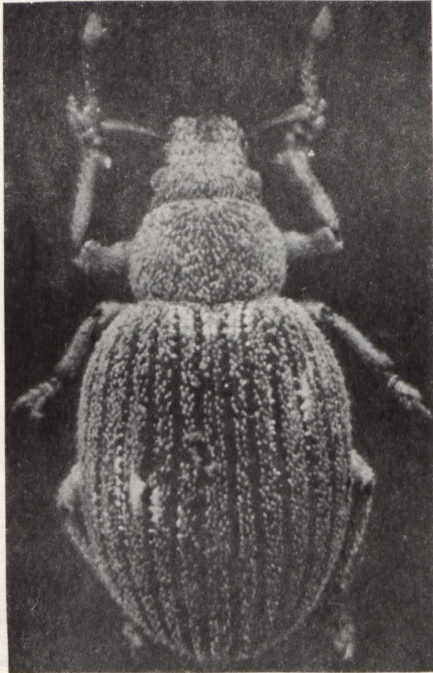
Fig. 3. Brachysomus strawiński n. sp.; Allotype, female