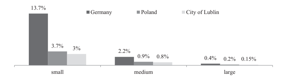
Figure 2. The most valuable forms of cooperation with vocational schools according to the employers (in %)

Respondents were also asked to indicate up to 5 forms of cooperation between schools and enterprises that they considered the most valuable. Their preferences have been presented in Figure 2.