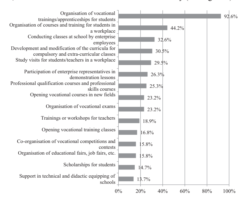
Figure 3. Percentage of small, medium and large enterprises in the city of Lublin, Poland and Germany

First of all, the enterprise sector in the city of Lublin, and in Poland, is very fragmented. Micro-enterprises in Poland constitute 95.2% of all enterprises, in Lublin – 96%, and in Germany – 83.6%. In Lublin and in Poland the share of medium and large enterprises, which are potentially the most valuable partners for vocational schools, is more or less 2.5 times smaller than in Germany (see Figure 3).