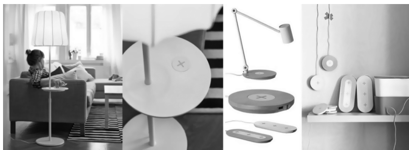
Figure 5. Internet of Things – IKEA

Source: http://www.wirtualnemedi.pl/artykul/ikea-zaoferuje-meble-ladujace-urzadzenia-mobilne (access: 02.02.2017).