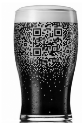
Figure 3. Creative utilization of QR code – Guinness brand