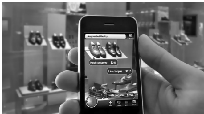
Figure 1. Augmented reality in the point of sale – a shoe shop

land, AR utilization for marketing purposes is still rare, but in the world it develops faster and faster. AR can also add variety to any kind of events, fairs, or business meetings, as well as occasional parties 3 . Figure 1 presents the possibility to use AR in the point of sale – a shoe shop.