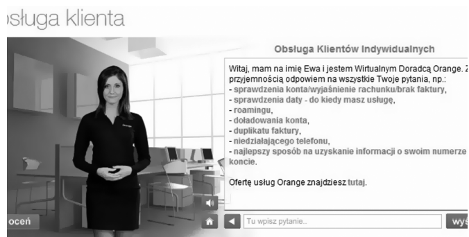
Figure 4. Virtual Orange Advisor – Ewa

An example of chatbot application in marketing communication is the Orange company. It has put in motion the Virtual Advisor Ewa on its own www page (Figure 4). Besides the extensive base of issues connected with customer service, this chatbot is able to answer a number of other questions 7 .