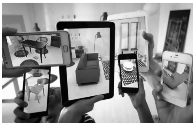
Figure 2. Augmented reality – IKEA

Other AR applications in marketing can be presented on the example of IKEA, where AR allows one to see the furnished interior through the AR overlay with pieces of furniture being accessible in IKEA shops (Figure 2).